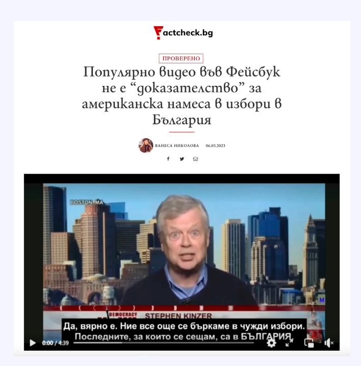
Factcheck.bg (Bulgaria). "A popular video on Facebook is not 'proof' of American interference in Bulgarian elections".

Among the false stories detected in the public debate before the elections, the one about the alleged deployment of Bulgarian soldiers in Ukraine , suggesting direct Bulgarian involvement in the war, was particularly relevant. Other notable stories concerned the country's membership to the European Union , falsely claiming that it was the only country that had not held a referendum on the issue or that the nation's production output was better before it became an EU member. Although not specifically related to the election process itself, unsubstantiated claims have been made about alleged influence in the vote by the United States.