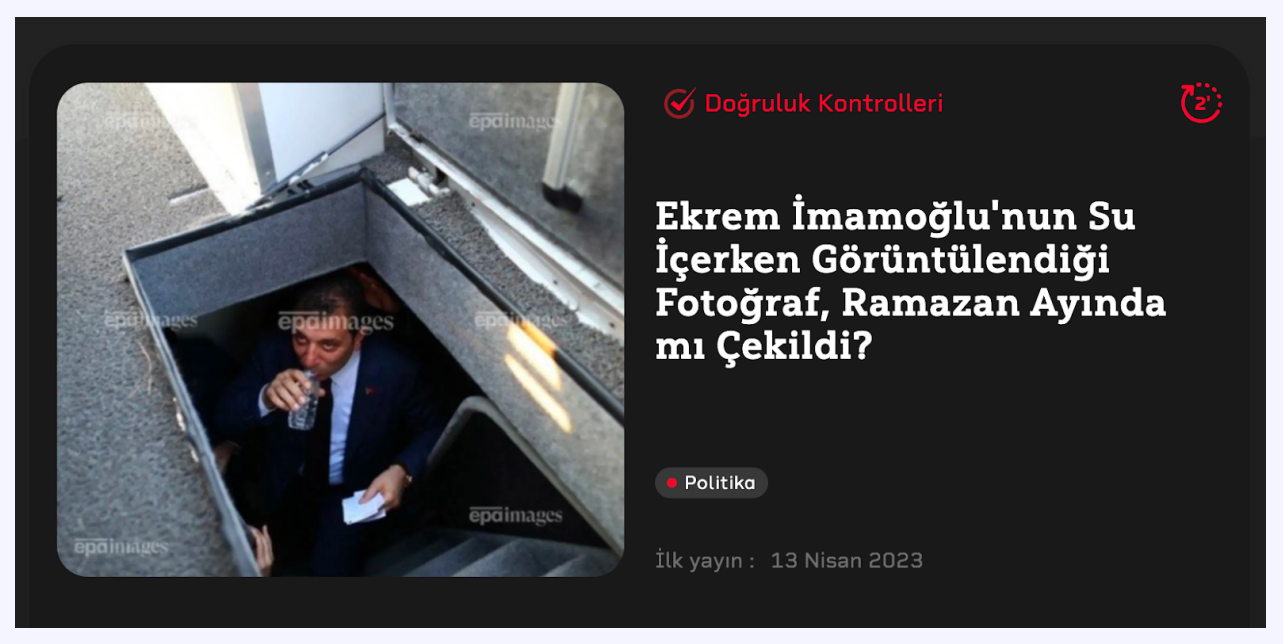
Doğruluk Payı (Turkey). "Was the photo of Istanbul Mayor Ekrem İmamoğlu drinking water taken during Ramadan?".

A prominent feature of disinformation in Turkey was its focus on religion . Given that the vast majority of the country's citizens identify as Muslim, faith was used as a tool to criticize politicians from different factions. For example, there were allegations of <u>alcohol consumption</u> and alleged episodes of repression against <u>veiled women</u> following Kemal Kılıçdaroğlu's candidacy. False stories circulated about a political party <u>distributing sweets during Ramadan</u> or the mayor of Istanbul secretly <u>drinking water</u> when he was religiously not allowed to. Other false stories were about Kılıçdaroğlu <u>allegedly making derogatory remarks about prophet Muhammad</u>, the son of the government-appointed President of the Directorate of Religious Affairs <u>consuming alcohol</u>, while other parties were falsely accused of wanting to <u>introduce</u> Sharia law.