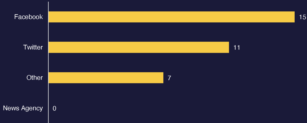
Number of disinformation items per platforms (Facebook, Twitter, News Agency, Other)