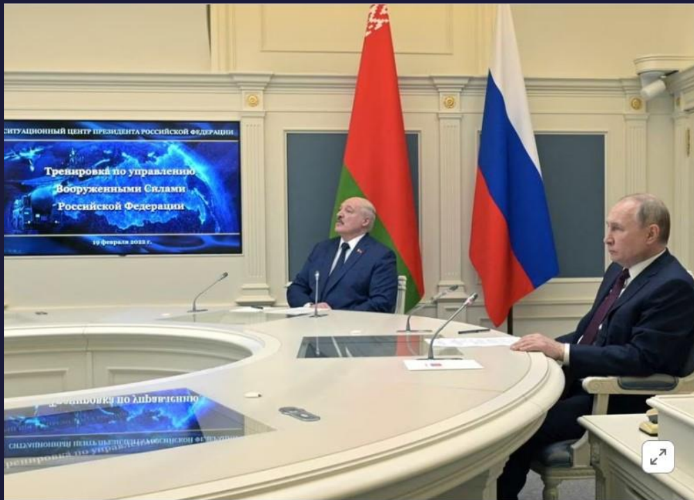
[1/2] Russian President Vladimir Putin and Belarusian President Alexander Lukashenko observe training launches of ballistic missiles as part of the exercise of the strategic deterrence force, in Moscow, Russia February 19, 2022. Read less

After President Vladimir Putin announced on 25 March that Russia will station tactical nuclear weapons in Belarus, disinformation on an escalation of the conflict to neighbouring countries and speculations about nuclear strikes are likely to grow.