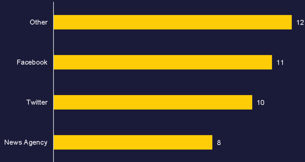
Number of disinformation items per platforms (Facebook, Twitter, News Agency, Other)