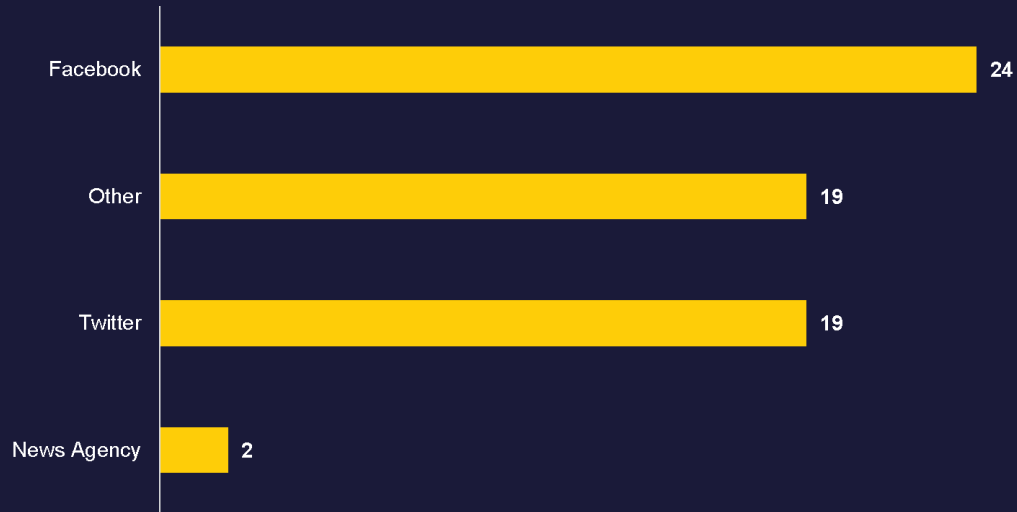
Number of disinformation items per platforms (Facebook, Twitter, News Agency, Other)